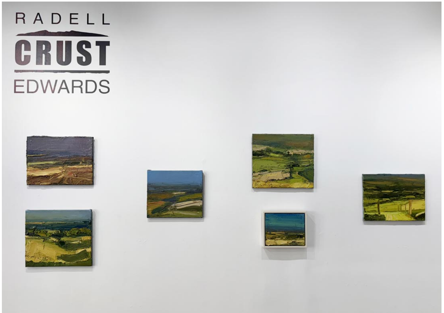
Alex Edwards (1969-) Install Shot of 6 Paintings Oil on canvas