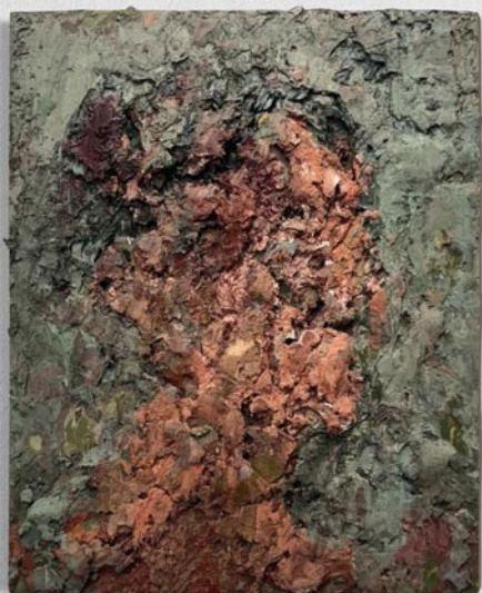
Thaddeus Radell (1946-) Head Study Oil, wax on panel Date: 2023 Size: 15" x 12"