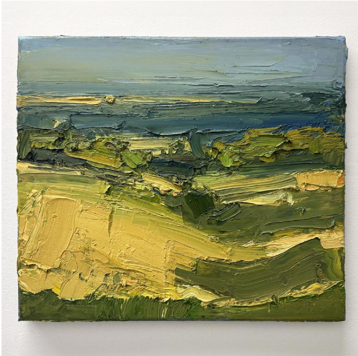
Alex Edwards (1969-) Rotherley Down Evening Sun II Oil on canvas Size: 14 x 16"