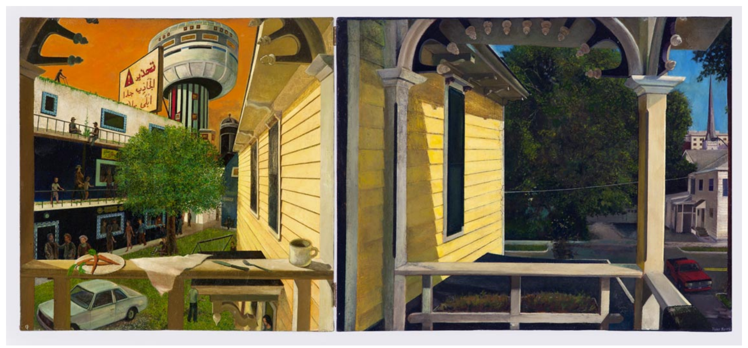
4 Lydia View #3 & 310 N Geneva Street, Ithica, NY Looking East / 2012 / Oil on canvas / Size: 68" x 30" (diptych)