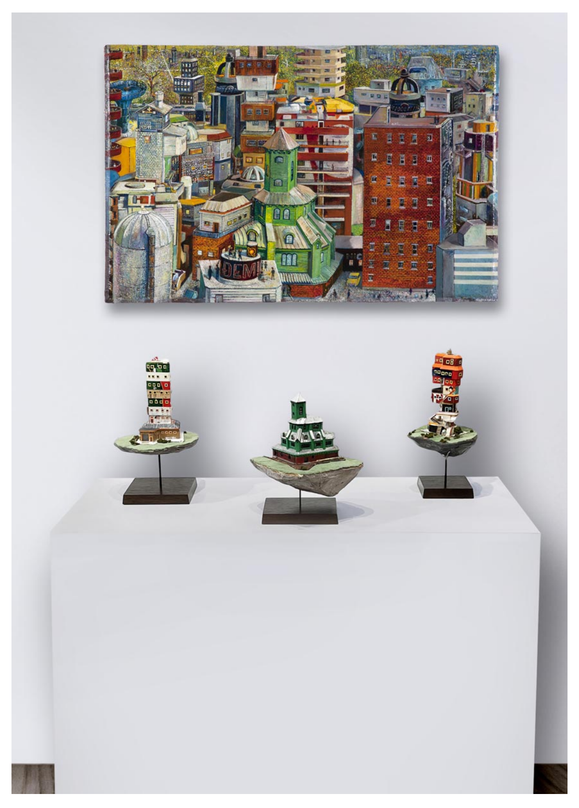
(above) 4 Lydia View #28 Jam! / Oil on canvas / Size: 36 1/4" x 23 3/4" (left) 8 Story Apartment Building / cardboard, paper, corduroy / 2020 (center) Green Church / cardboard, paper, corduroy / 2020 (right) Attorney General's Office / cardboard, paper, corduroy / 2020