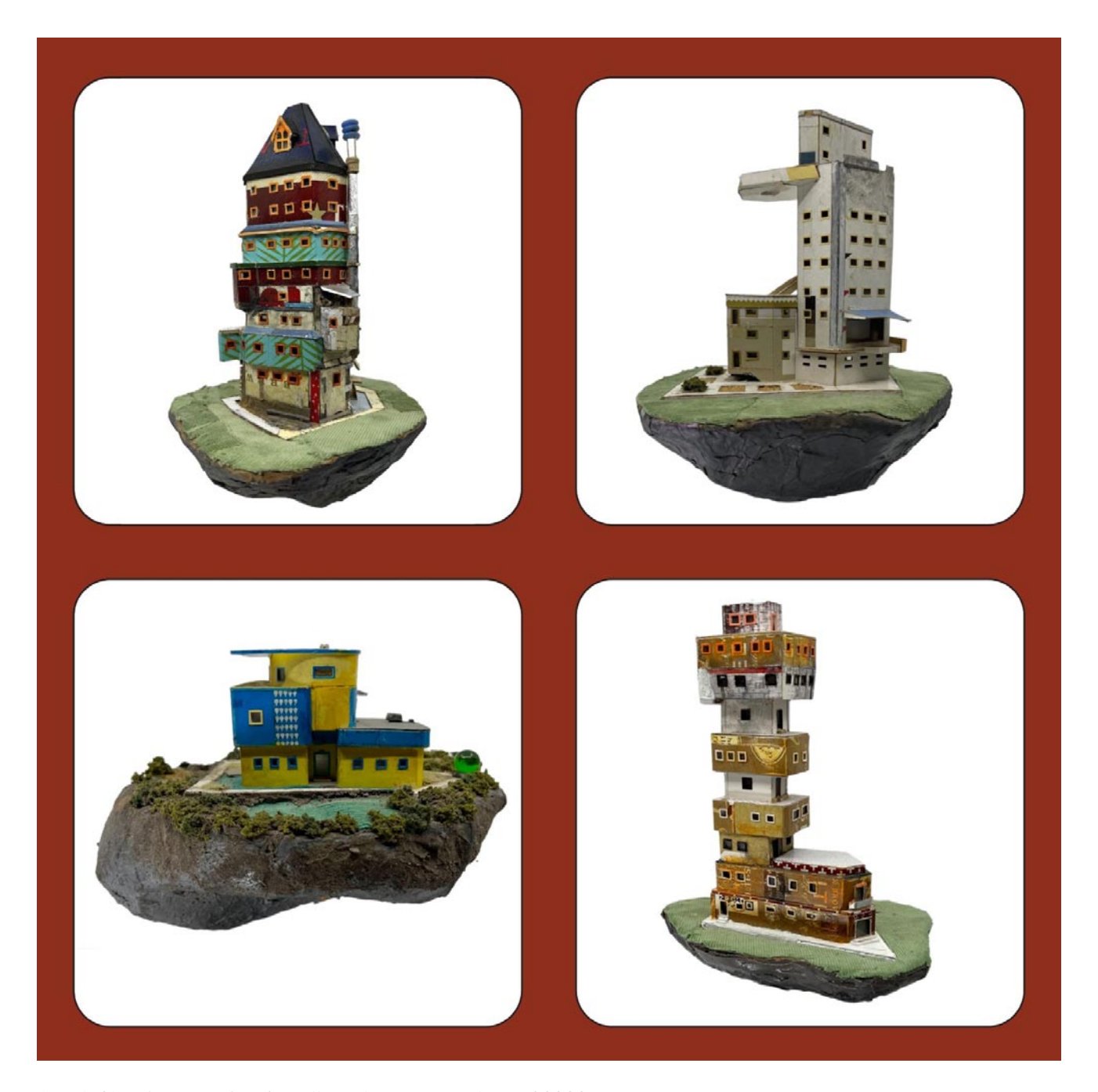
(top left) RAD Housing / cardboard, paper, corduroy / 2020 (top right) Mille Apartment Building / cardboard, paper, corduroy / 2020 (bottom left) Almond Apartments - cardboard, paper, corduroy / 2020 (bottom right) 5540 Redux / cardboard, paper, corduroy / 2020