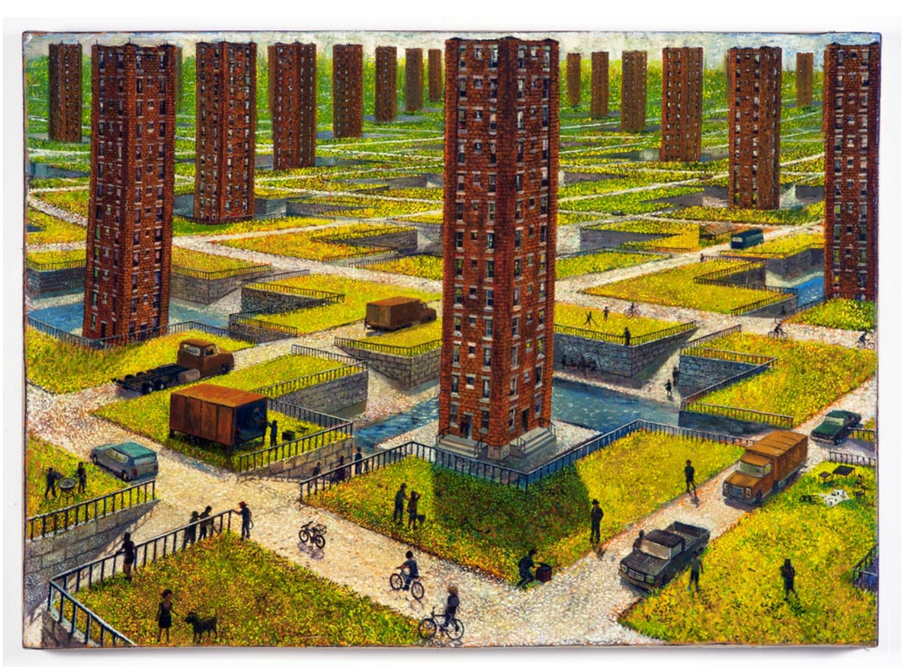
Fairgrounds #9 / Oil on canvas / 2015 / 52 1/4" x 37 3/8"